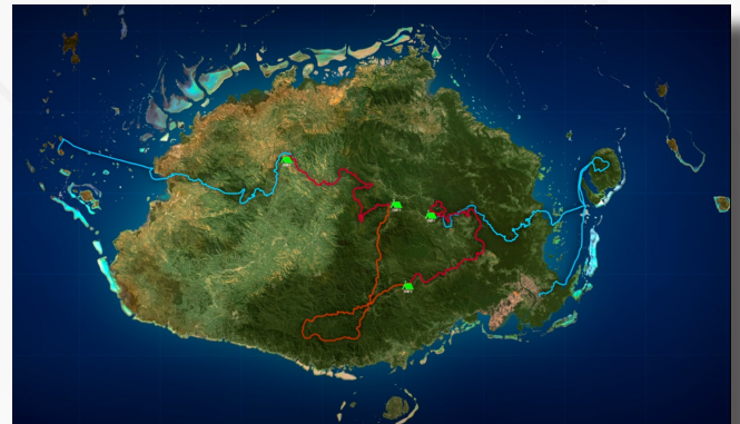
3D Web application tracking competitors in real-time