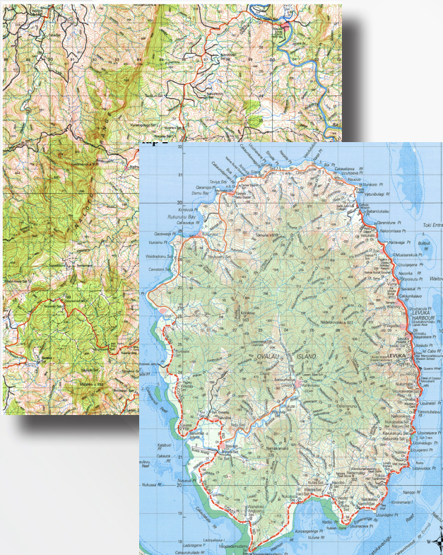
Custom travel maps produced for competitors 7 maps & 2 nautical charts per team