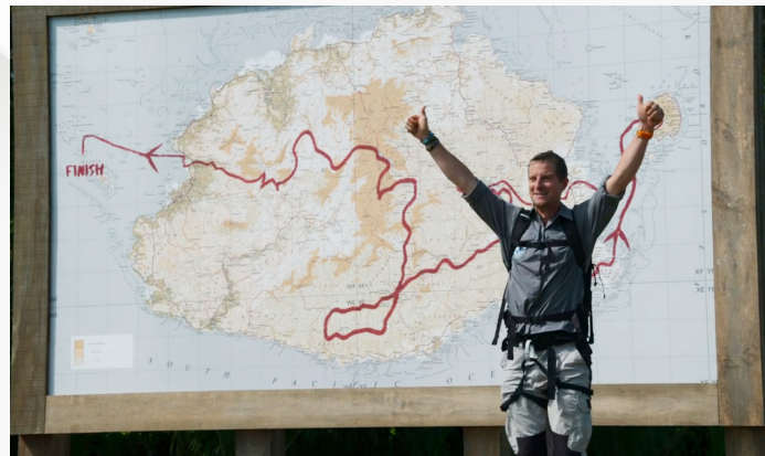
Host Bear Grylls unveils the course map